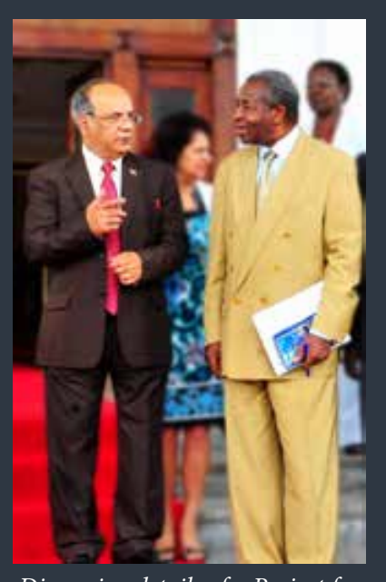
Discussing details of a Project for Development of Uganda's Agriculture Sector with Hon Tress Bucyanayandi Ugandan Minister of Agriculture, Industry & Fisheries